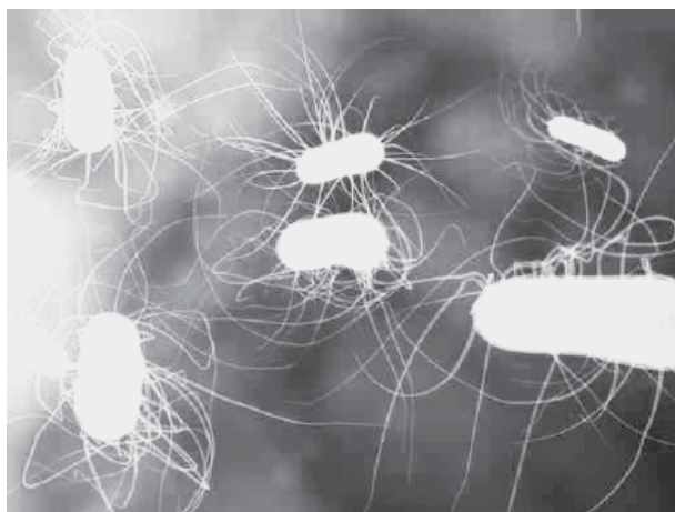
Fig. 1. Pseudomonas putida [6] Rys. 1. Monad putida [6]

These are gram-negative, chemoorganotrophic, aerobe obligate. The cells are of spherical shapes, the average size of the cells fluctuates between 0.5 and 3.5 \mu\text{m} ; they occur individually or two and more cells aggregate into irregular clusters, sometimes tetrads or bundles. They grow under aerobic conditions in common culture media, under the optimum temperature of 25 – 35 °C. On the culture media they form shiny colonies with the dimensions of 2 – 4 \mu\text{m} . Many colonies precipitate pig-