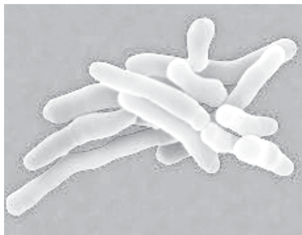
Fig. 2. Rhodococcus sp. [9] Rys. 2. Rhodococcus sp. [9]