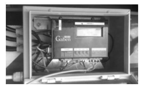
Fig. 3 Industrial computer for data collection and processing Rys.3 Przemysłowy komputer dla zbierania i przetwarzania danych