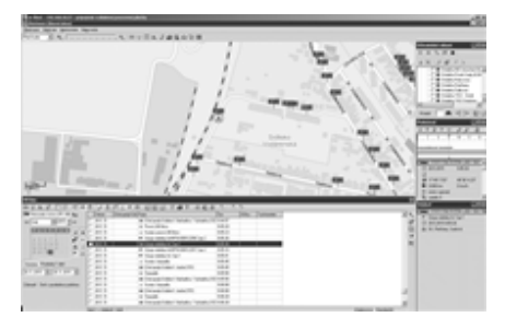
Fig. 4 SW application Rys. 4 Aplikacja SW

containers itself is carried out by industrial high powered reader with adjustable power and special antennas. UHF RFID reader used in the described system is called Impinj Revolution R 420. The reader has four antenna connectors of which only two are used to connect to two linearly polarized UHF RFID antennas of the type H86-AD with the gain of 1,5dBi tuned for the frequency band 865-870MHz. High reader sensitivity of -84 dBm allows us to ensure high level or RFID tags readability. The reader power is adjustable in the range of 10 to 31.5 dBm so as to allow the precise identification of only the raised container and not the surrounded ones. Reader is together with other electronics placed in the anti-vibration box with the IP65 protection certification and dimensions 300x250x150 mm. The reader is powered via connection to the vehicles onboard electrical distribution system with 12/24 V converter, capable of supplying power of 15 W.