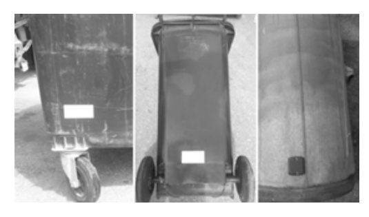
Fig. 1 RFID tags on plastic and metal container Rys. 1 Znacznik RFID dla plastików i kontenerów metalowych