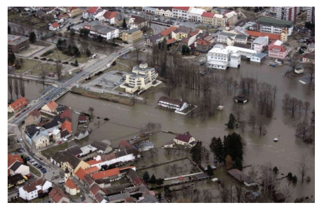
Fig. 1. Flooded area due to flood in 1997 [2] Rys. 1. Zalany teren w związku z powodzią w 1997 r. [2]