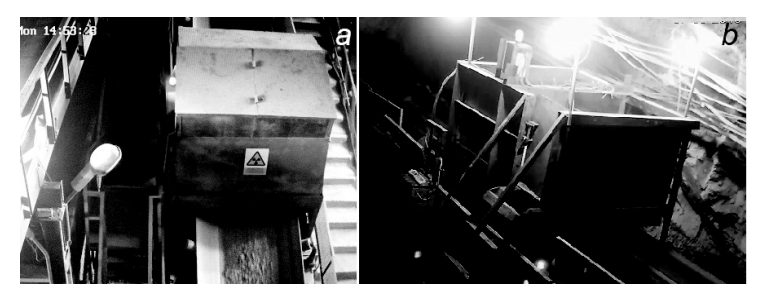
Fig. 2. RLP-21T at the conveyors of Karagaily Concentrator and Nurkazgan mine. Conveyor 4 at Karagaily Concentrator (a) and conveyor at the Nurkazgan mine (b)

Rys. 2. RLP – 21T na przenośnikach w zakładzie wzbogacania Karagaily i kopalni Nurkazgan. Przenośnik 4 w zakładzie Karagaily (a) i przenośnik w kopalni Nurkazgan (b)